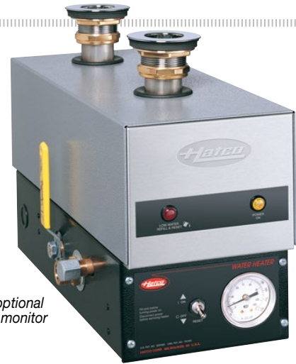
3CS-9 with optional temperature monitor