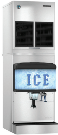
FD-650M_J-C on DM-4420N