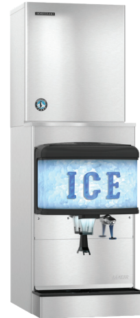
FS-1022MLJ-C on DM-4420N