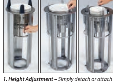
1. Height Adjustment – Simply detach or attack springs to adjust tension for the height level you desire.

2. & 3. Adjust-a-Fit* Size Adjustment – Easily re-position and lock the dish guides with a turn of the wrist. No tools necessary!