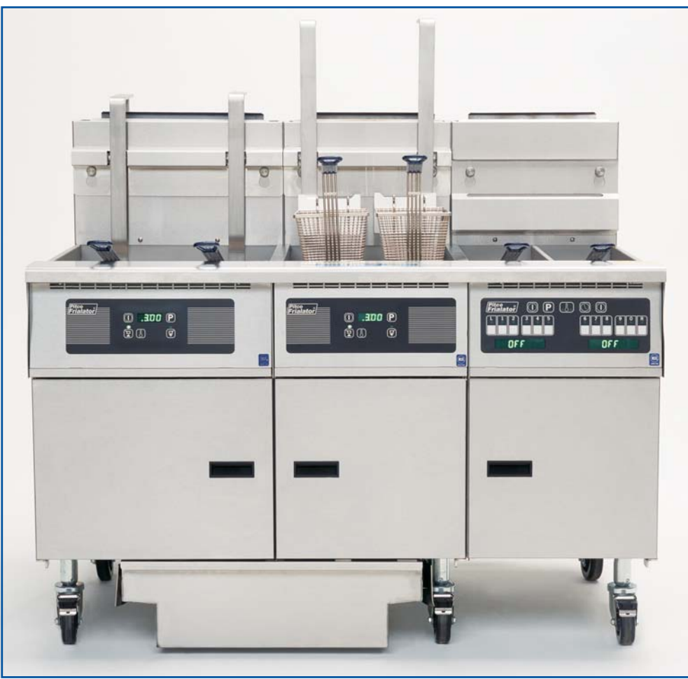
Any Combination, Any Fuel