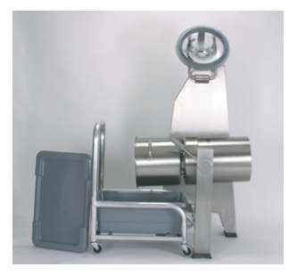
FOOD CART SHOWN WITH VCM