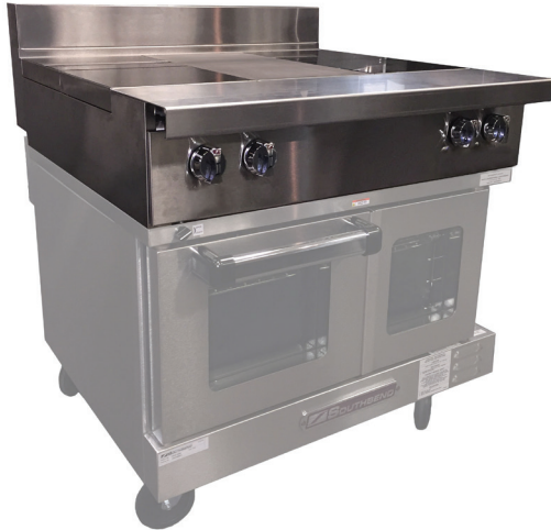
Model P36T-ISI shown

For use with induction safe cookware ONLY. Look for the induction ready logo below.