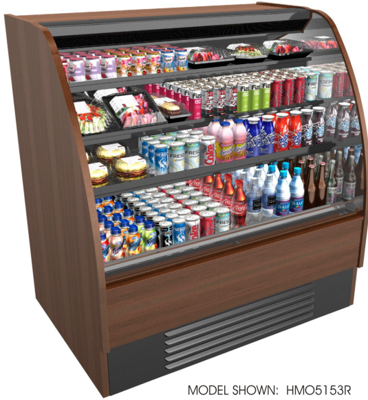
MODEL SHOWN: HMO5153R