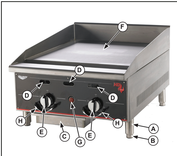
Figure 1. Features and Controls.